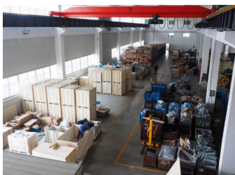
4. Professional placement