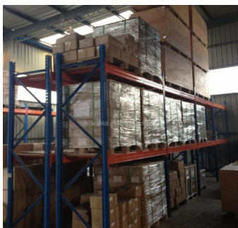
1. Special logistics packaging

Delivery Details : 3-30 days after order of Solid bicycle tire tubes