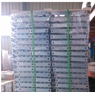
2. Suitable carton size