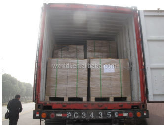
5. Professional shock