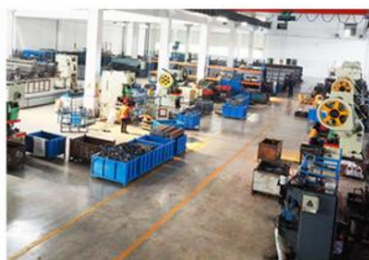
Stamping Workshop ▼