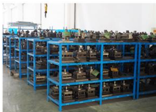
Mold Library ▲